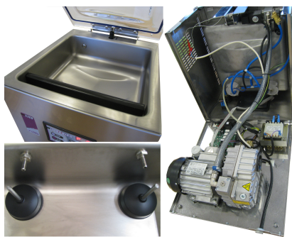
SEALING BAR 310mm VACUUM PUMP 8 m 3 /h SENSOR CONTROL